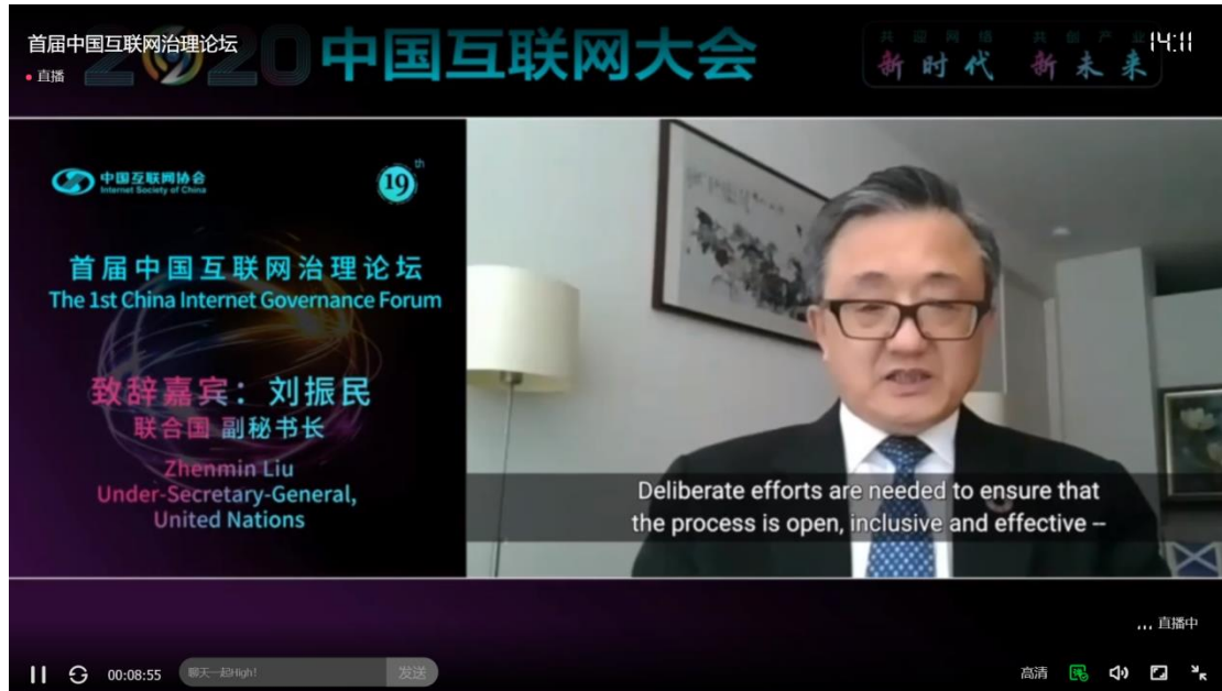
Liu Zhenmin, Under-Secretary-General of the United Nations