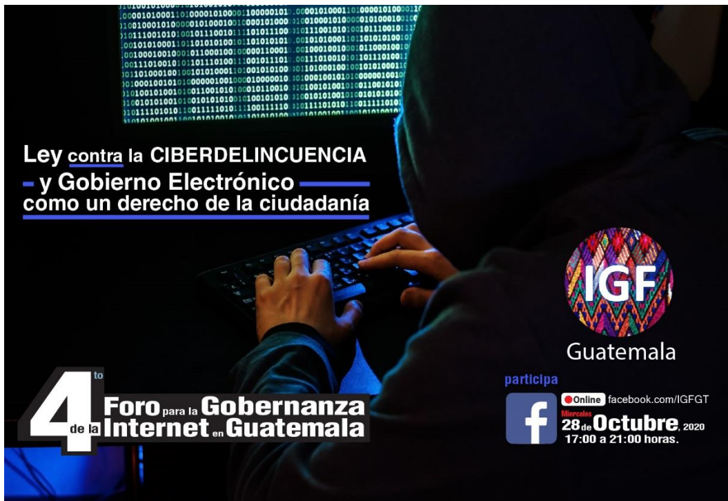
Invitation to the Cybersecurity Forum.