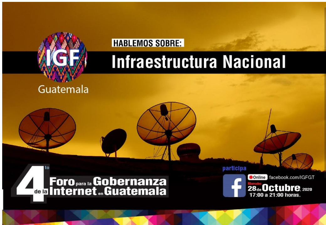
Invitation to the Infrastructure Forum.