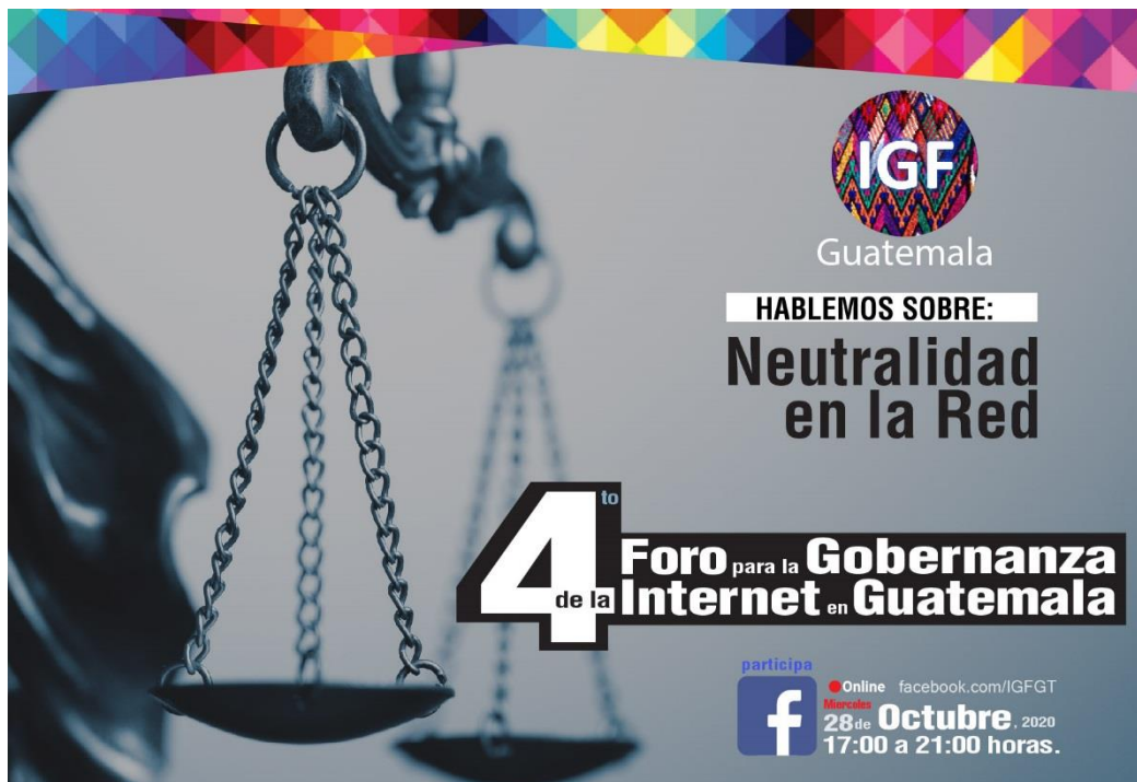
Invitation to the Network Neutrality Forum.