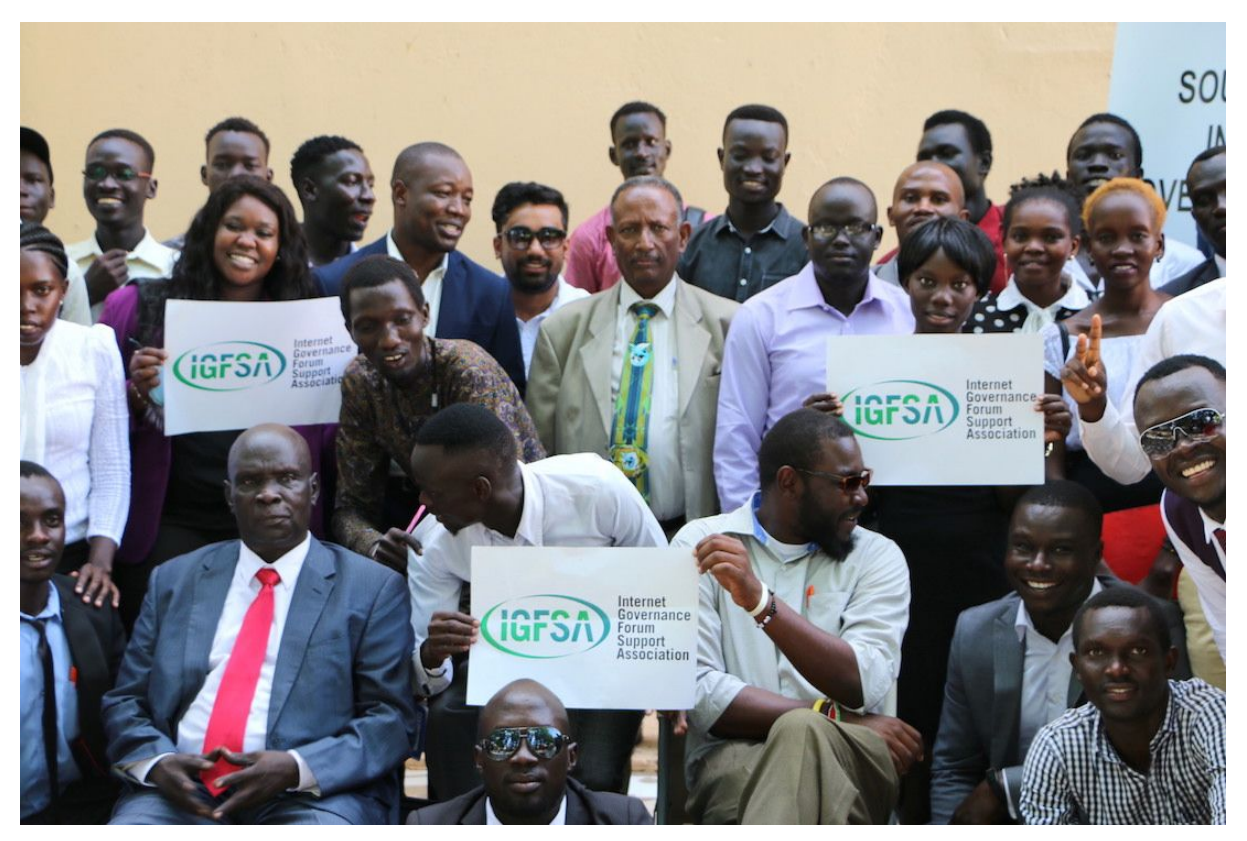
Participants holding the IGF Support association logo after the South Sudan IGF conference

Universal Service and Access Funds (USAFs) are a funding mechanism to incentivise the expansion of internet services in remote and underserved locations. These funds — typically financed through mandatory contributions from telecommunications service providers — are designed explicitly to address access and use gaps in communications services. USAFs offer a promising path to develop and implement the policies and programmes needed to close the digital divide and, specifically, to tackle barriers to internet access and use for women. But, as previous research has shown, they are often an untapped or otherwise underutilised resource for financing universal access efforts. This issue is compounded by the fact that information — let alone up-to-date data — on the use and effectiveness of USAFs is often kept behind closed doors, or is missing entirely