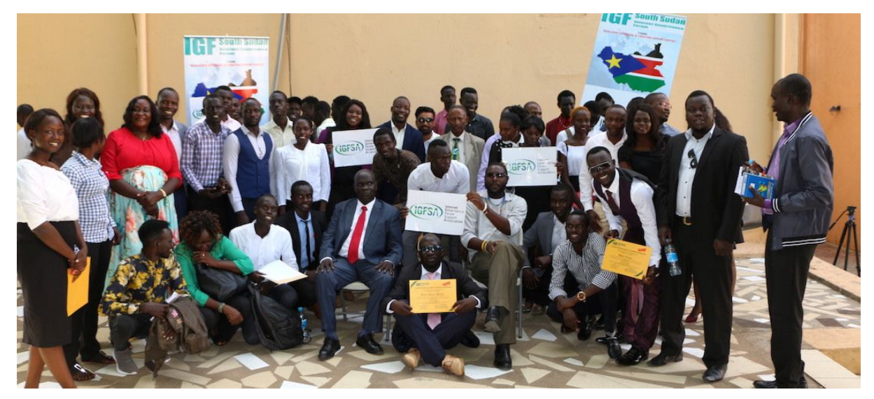
Group photo after the South Sudan IGF conference , Juba, South Sudan. 28th March 2019

The need to have a strong and robust broadband connectivity is very vital for the development of a country. This however, needs to also be accompanied with the development of an informed and knowledgeable public who are able to make use of the networks to develop their communities and country. The case for South Sudan needs the two elements cited above to be addressed. The country's challenges of connectivity are inseparable from that of people's development.