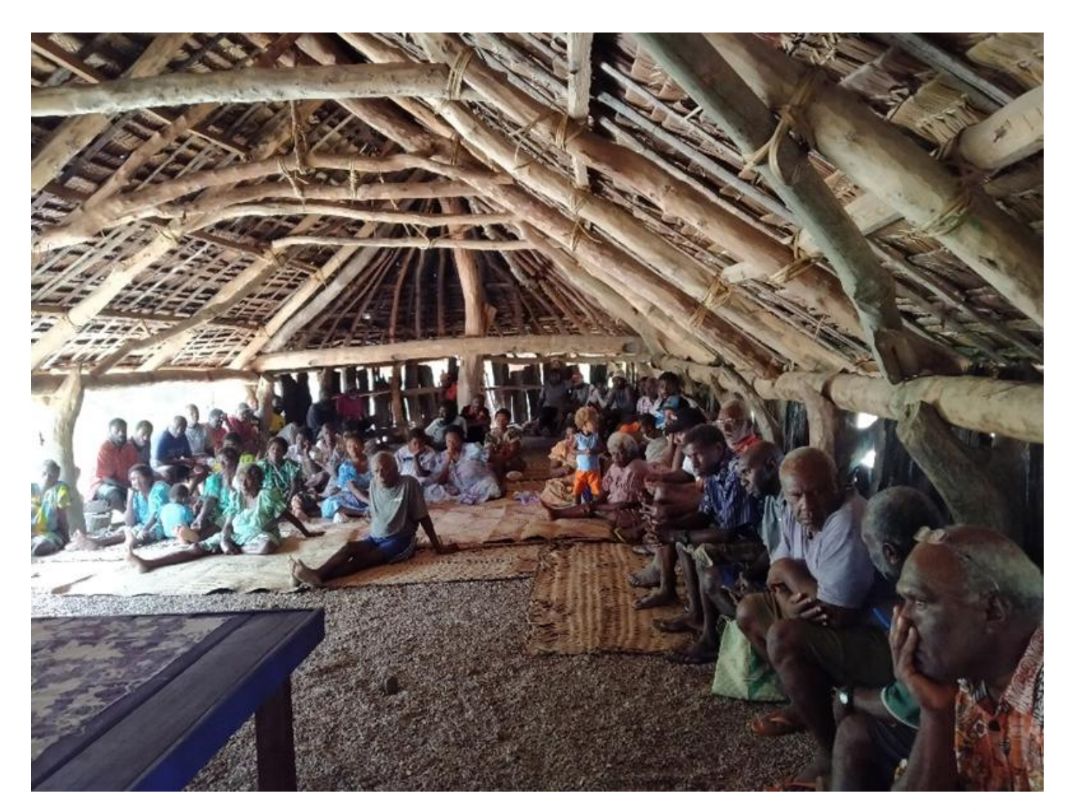
Photo 9 - Our "TingtingBifoYuPost" Campaign speaks to the community at Nikaura village, Epi Island