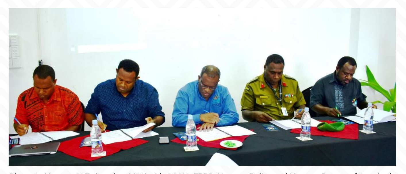
Photo 6 - Vanuatu IGF signed an MOU with OGCIO, TRBR, Vanuatu Police and Vanuatu Bureau of Standards for a working relationship