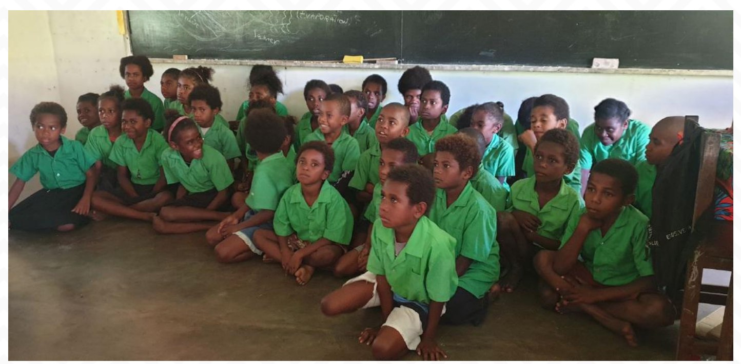
Photo 1- Pupils laugh when asked if they have knowledge of Facebook, at Ecole Publique de Kutundaula, Tongoa Island