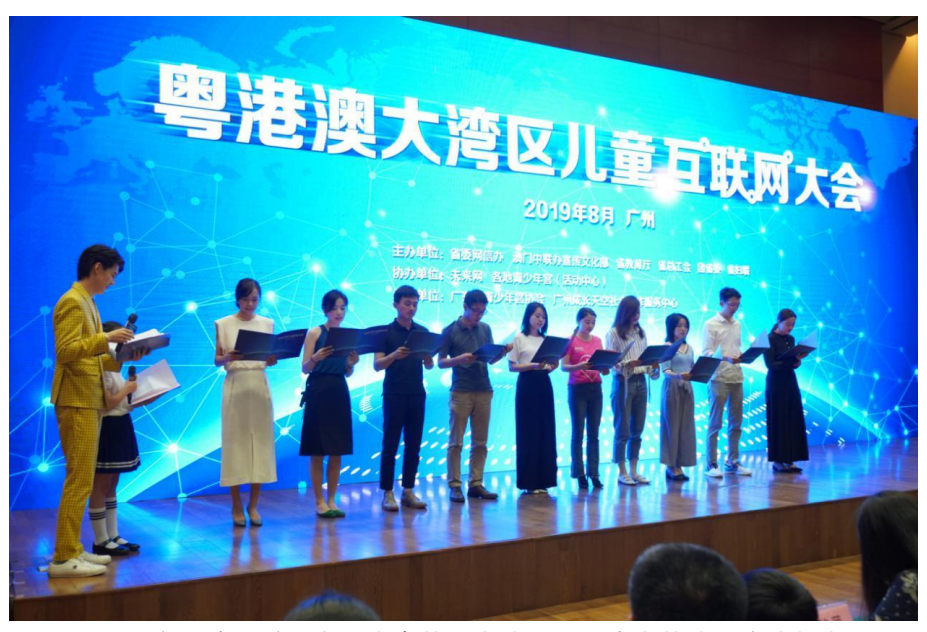
(图片说明:参会的互联网企业代表共同宣读倡议,约定共建网络清朗空间) (Photo caption: The representatives from various Internet companies jointly read out the declaration and committed to creating safer cyberspace for our next generation)