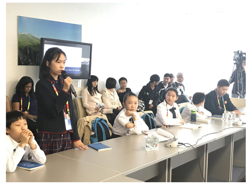
(图片说明:CRO儿童互联网小使者出席APrIGF亚太联合国管治论坛,并作为论坛最小的儿童代表发言) (Photo caption: Child Internet Ambassadors [CRO] attended the Asia Pacific regional Internet Governance Forum [APrIGF]. They were the youngest speakers, actively contributing to the discussions in the forum)