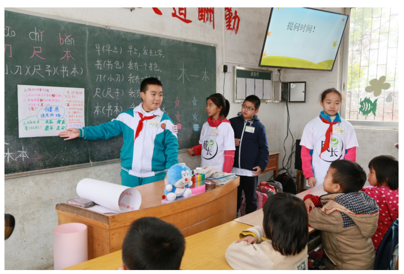
(图片说明:E成长小讲师到乡村小学,为乡村小伙伴们分享网络安全知识) (Photo caption: E-Growth Youth Lecturers visited the rural primary schools to share cybersecurity knowledge with local children)

Enping, Guizhou, Sichuan, and Guangxi. Meanwhile, the professional adult trainers, who accompanied the child representatives voluntarily during the trips, had also conducted workshops and training with the primary school teachers and parents in the visited local villages.