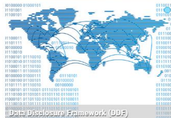
Data Disclosure Framework (DDF)