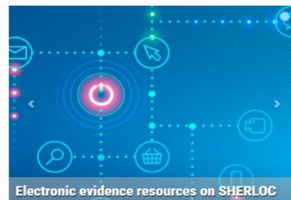
Electronic evidence resources on SHERLOC