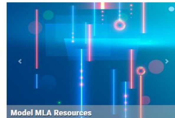
Model MLA Resources