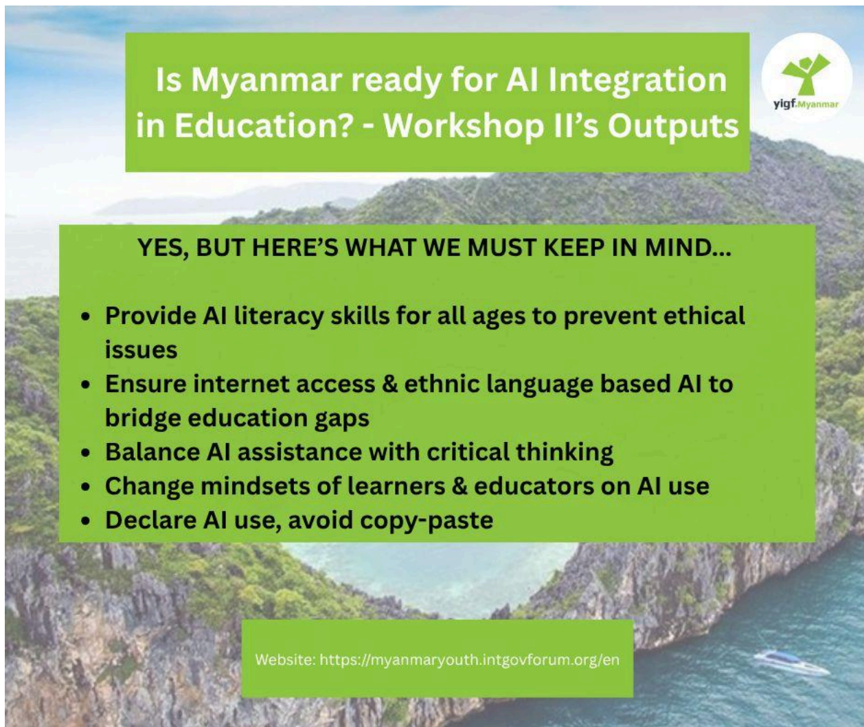
Figure 4. Overview of the outputs from Workshop 2