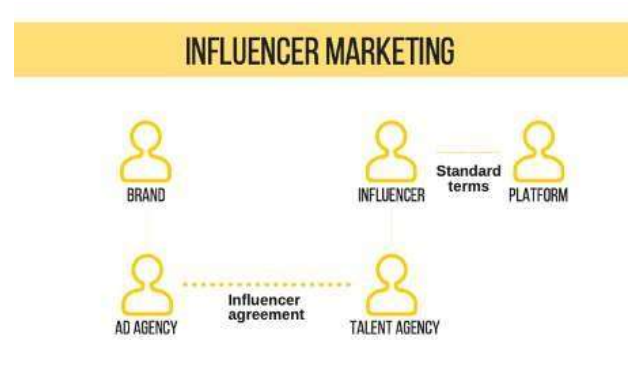
Figure 1 - Goanta & Wildhaber, 2020

sensu, namely to indicate those social media users who engage in influencer marketing as a business model (see Figure 1 below).