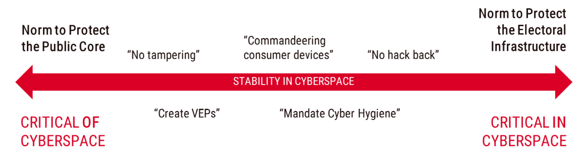
Figure 3 Spectrum of GCSC norms ranging from norms that are "critical of cyberspace" to "critical in cyberspace"

As a first step, recognizing the global reliance on cyberspace, the increasing dependence of other infrastructures on its reliability, and the potentially dramatic consequences of its disruption, the Commission urges for the protection of the Public Core of the Internet as the first operational norm that meets the most obvious urgent international norm that is critical of cyberspace. Secondly, the GCSC identified the protection of the electoral infrastructure, which advocates a prohibition on the disruption of elections through cyber attacks on its technical infrastructure, as an urgent norm that is critical in cyberspace. Moving forward, the Commission is set to publish a number of additional norms of responsible behavior. Once finalized, the norms will urge governments and others to avoid taking actions that would substantially impair the stability of cyberspace, including inserting vulnerabilities into products and services, commandeering others' devices to create botnets, and allowing non-state actors to conduct offensive cyber operations. The norms will also urge action to preserve the stability of cyberspace, including establishing vulnerabilities equities processes and enacting basic cyber hygiene.