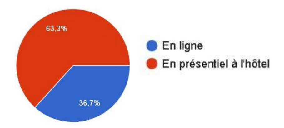
Figure 2: Repartition by mode of participation

Online, there were 36.7% of participants equivalent to 60 persons, while 63.3% equivalent to 76 people were indoors. The bias noted between the number of people registered and the participation rate can be explained by the fact that not all the people registered to be in person or online participated according to the mode of participation they chose.