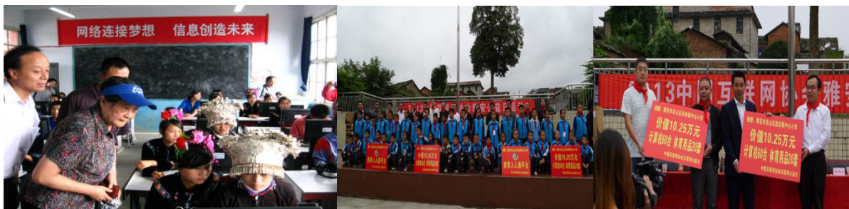
(Internet-based Classrooms Donated by e-Charity Day Initiative)