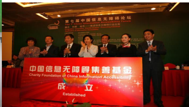
(Co-organized the annual China Information Accessibility Forum)