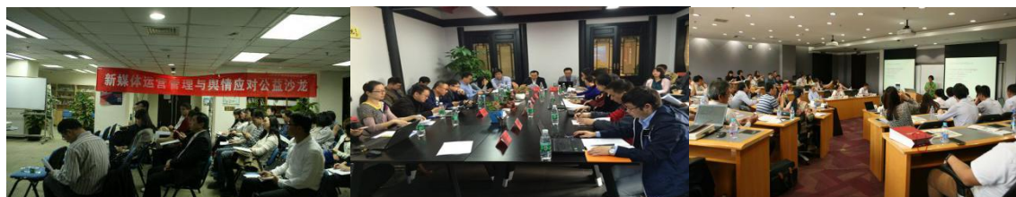
(Organized workshops and salons to discuss hot spots issues)