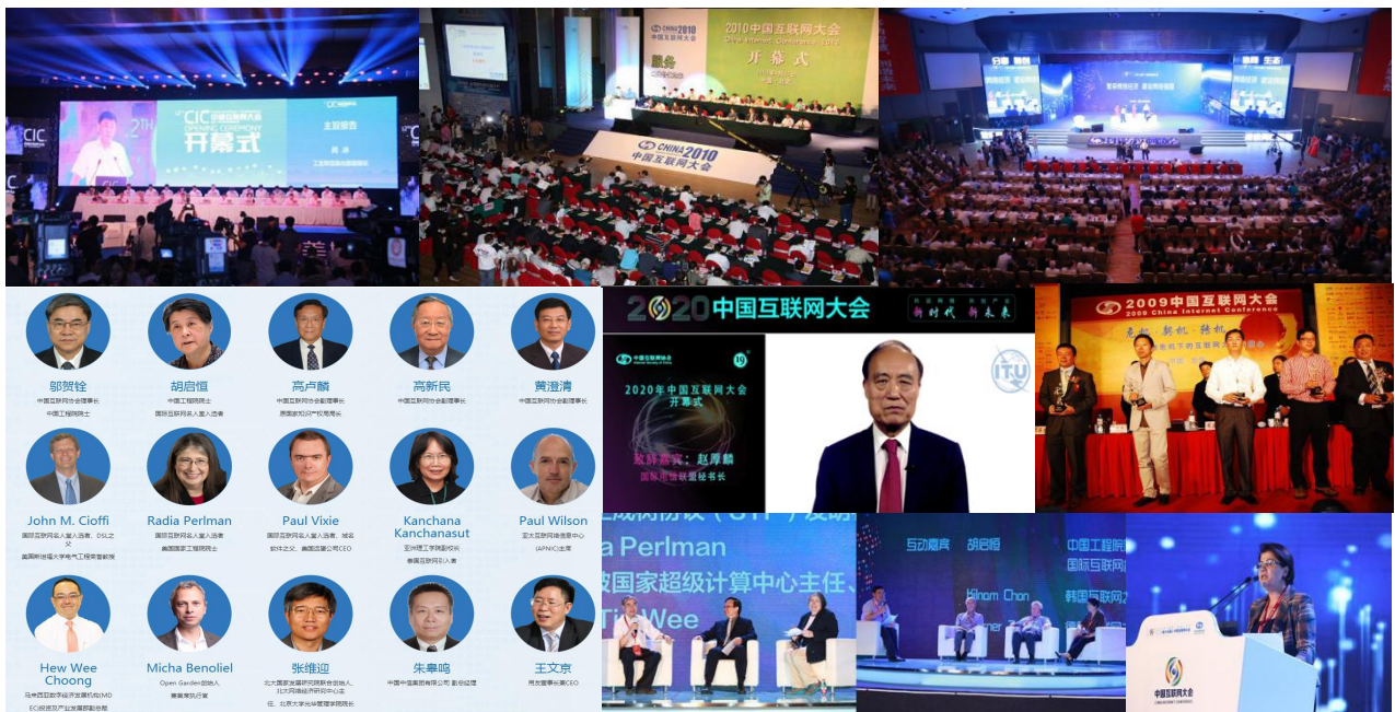
(Hosted the China Internet Conference)

Besides, various themes and subjects of Salons, workshops, forums, meetings were organized to discuss the Internet development and emerging issues.