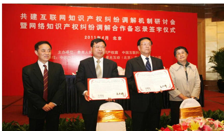
(Signed the MoU on Copyright Dispute Mediation Cooperation with the Supreme Court)