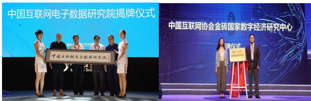
(Set up the research centers on electronic data, digital economy)

ISC carried out research on the development status of the industry, new technology applications, as well as other hot spots issues. It also published statistical data and research reports, made policy recommendations to relevant government departments, and provided relevant information services for the industry.