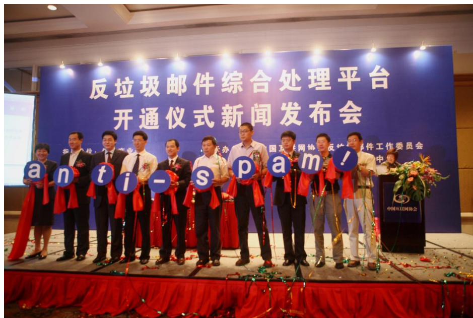
(Set up the Comprehensive Anti-Spam Processing Platform)

ISC began to research and fight against Spam in 2001, and now it has developed a comprehensive Spam governing mechanism. ISC set up the Comprehensive Anti-Spam Processing Platform in 2007 and now its White-list System covers 90% of domestic ESPs. Meanwhile, ISC set up the 12321 Unsolicited Electronic Messages Complaint & Reporting Center in 2008 to handling the report on electronic message abuse. Internet users could report electronic message abuse through ways of email, SMS, APP, WeChat, Weibo, Web, Hotline etc.