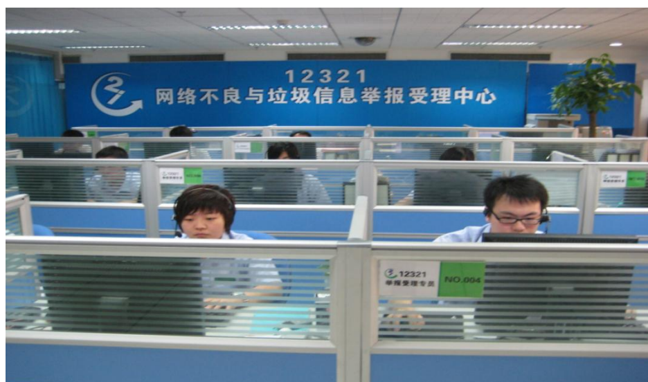
(12321 Unsolicited Electronic Messages Complaint & Reporting Center)