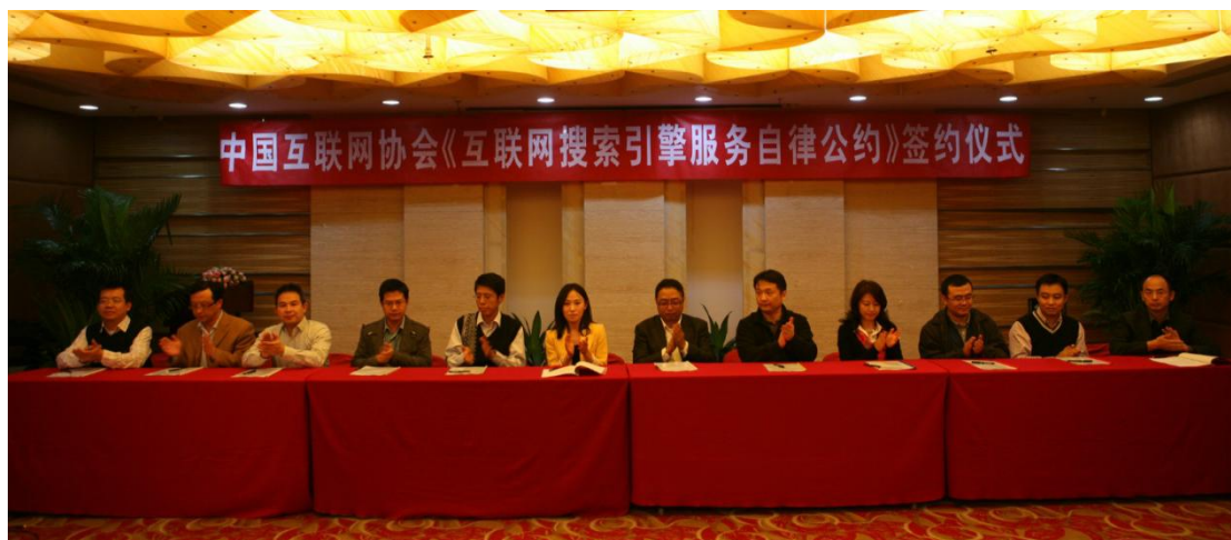
(Organized to Sign the Self-discipline Convention on Internet Search Engine Service)

ISC also launches initiatives to create a trust online environment by pushing forward the Internet company credit rating assessment, promoting online copyright protection, calling for resisting online pornography etc. ISC set up Illegal Information Reporting Centre to receive public reporting and has received more than 3 million pieces of reporting since 2004.