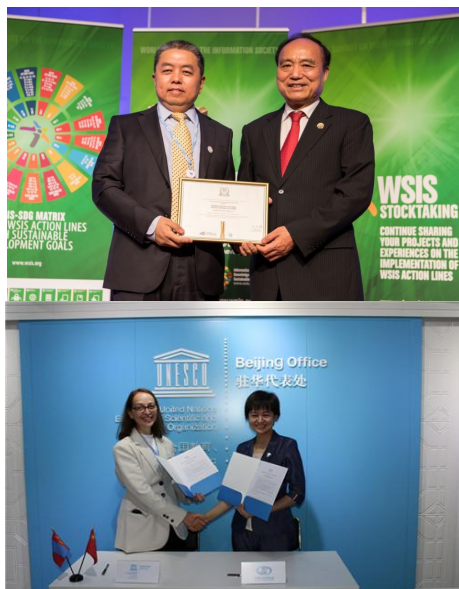
(The “China Information Accessibility Public Service Platform” Project won the 2017 WSIS Prize by ITU.)

By organizing the annual China Information Accessibility Forum since year 2004, ISC calls for joint efforts to an inclusive and barrier-free information society, especially for the people with disabilities. ISC launched Accessible Website and Technology Application for 2008 Beijing Olympic and Paralympic Games to improve websites function for the people with vision and hearing disabilities by installing a speech broadcast system, automatic enlargement system and automatic sign language software into the websites. The same efforts are also made for the World Expo 2010 held in Shanghai. To call for efforts to shrink the digital divide, ISC launched the “e-Charity Day” initiative which had already donated 13 Internet-based classrooms to the poor and the minority areas in the west parts of China since 2005.