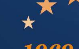
曼努埃尔·卡斯泰尔斯 (Manuel Castells)

It has been a great project and I am glad to see it being done.