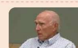
伦纳德·克罗斯 (Leonard Kleinrock)

It has been a great project and I am glad to see it being done.