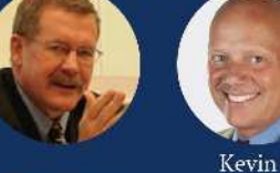
曼努埃尔·卡斯泰尔斯 (Manuel Castells)

It has been a great project and I am glad to see it being done.