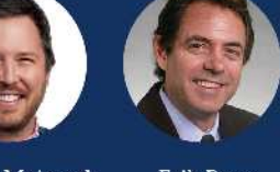
曼努埃尔·卡斯泰尔斯 (Manuel Castells)

It has been a great project and I am glad to see it being done.