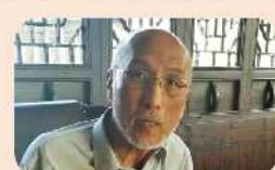
鲍勃·卡恩 (Bob Kahn)

It has been a great project and I am glad to see it being done.