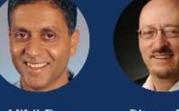
曼努埃尔·卡斯泰尔斯 (Manuel Castells)

It has been a great project and I am glad to see it being done.