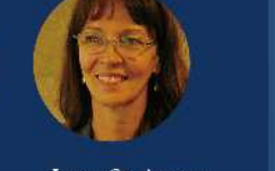
曼努埃尔·卡斯泰尔斯 (Manuel Castells)

It has been a great project and I am glad to see it being done.