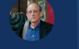
曼努埃尔·卡斯泰尔斯 (Manuel Castells)

It has been a great project and I am glad to see it being done.