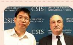
米切尔·卡普尔 (Mitch Kapor)

It has been a great project and I am glad to see it being done.