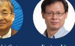
曼努埃尔·卡斯泰尔斯 (Manuel Castells)

It has been a great project and I am glad to see it being done.