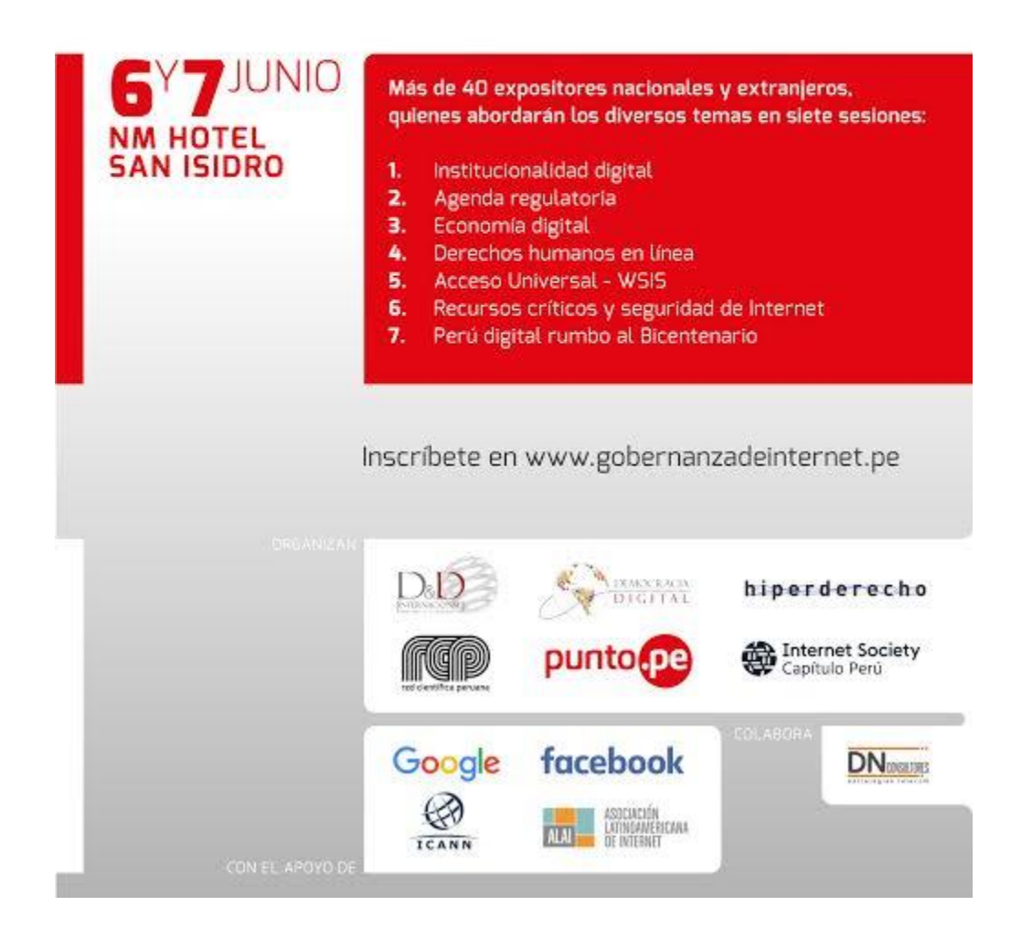
Official Banner of National IGF of Peru*