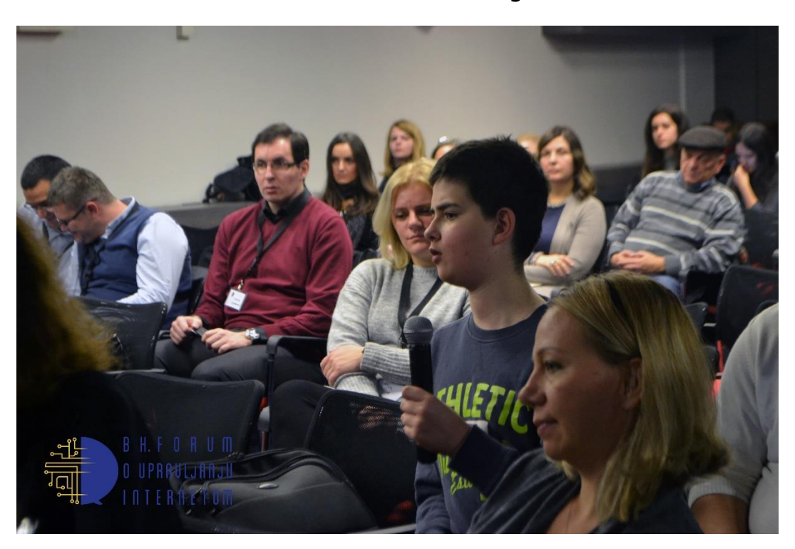
Comments of the audience

One of the conclusions at the end of this panel mentioned the need for a faster response of the competent institutions in cases of violations of children's rights. It has also been emphasized that services for reporting violation of rights need to work on their greater visibility as well as on the visibility of police services and other institutions that in these cases can provide assistance with the aim of returning citizens back their trust in these institutions. Finally, education is the key to solving this problem, and it would be urgent to start working on changing curricula in schools across Bosnia and Herzegovina.