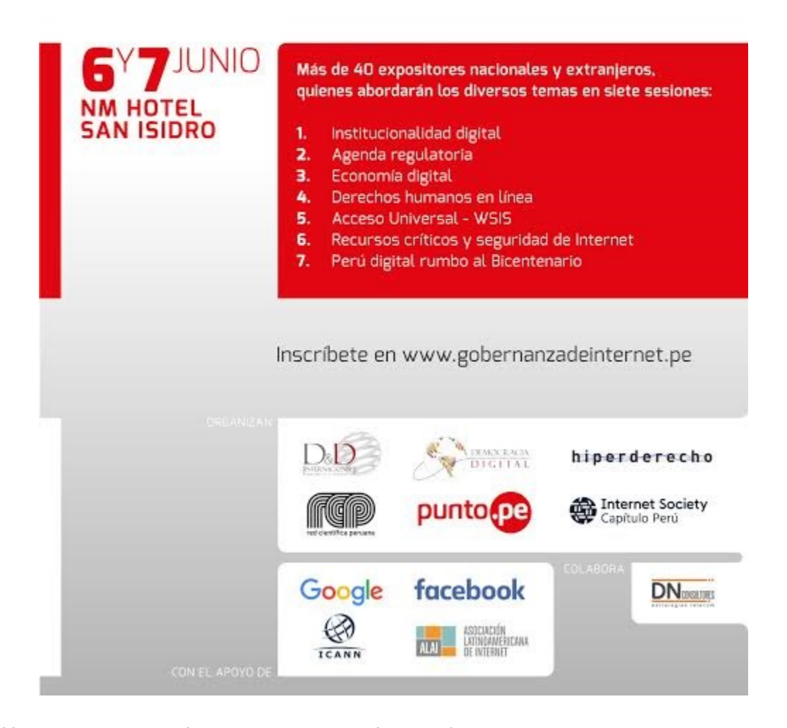
Official Banner of National IGF of Peru*